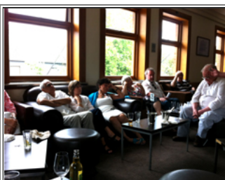
Attendees in the upstairs room at the Bar