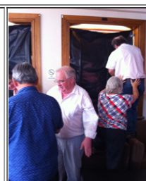
With the task completed, the