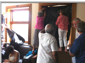
Everyone helped put up the plastic which