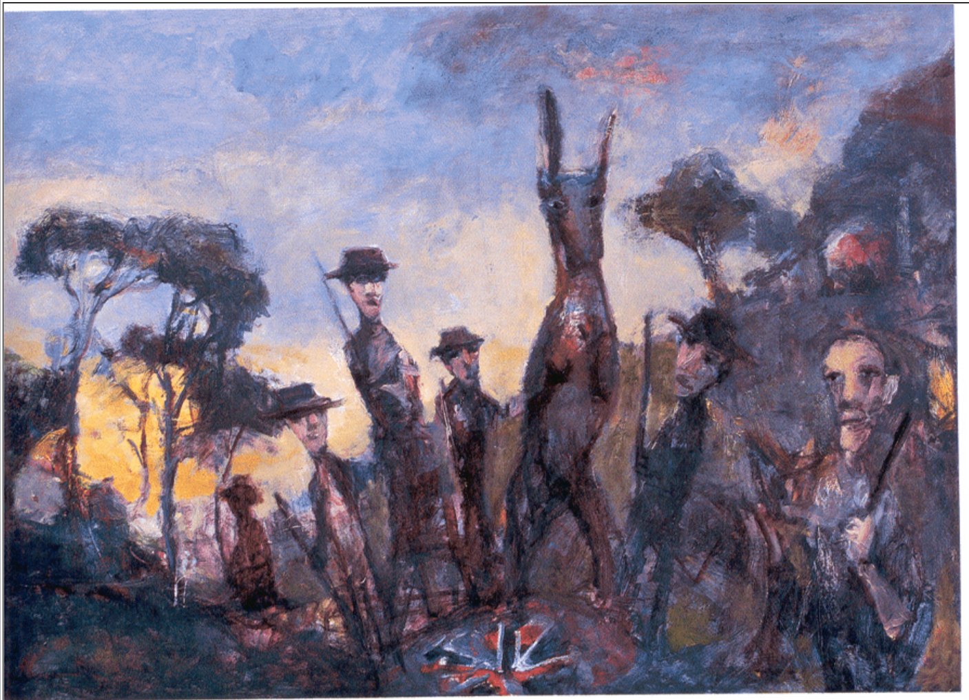
Artist Garry Shead's depiction, from his Kangaroo series, of the secret army that Lawrence calls "The Maggies" in Kangaroo.