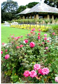
The Rose Garden Pavilion was provided to the Society for the event by the Royal Botanic Garden