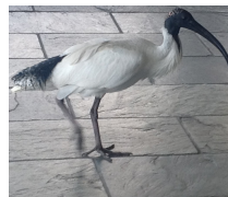
The ibis picked up some literary crumbs