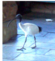
A friendly ibis joined the party