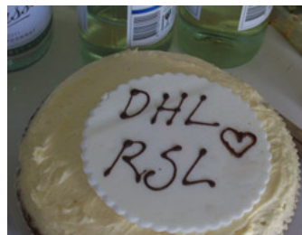
The cake, wrongly inscribed RSL instead of RLS (even today, the "Diggers" have an influence)