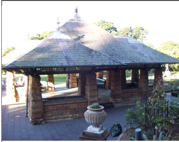
The Rose Garden Pavilion