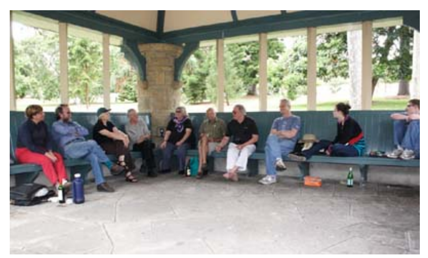
The Society holds its AGM