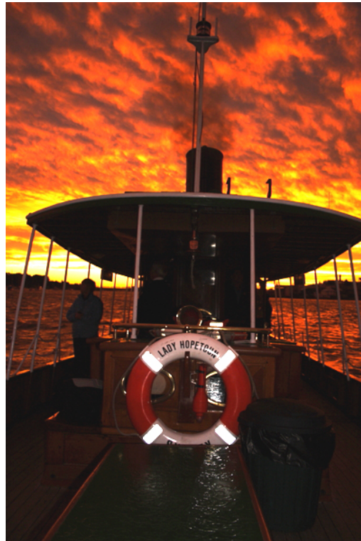
The Lady Hopetoun lit up by the sunset

President of the DH Lawrence Society of Australia